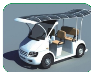
Travel Tourism Car