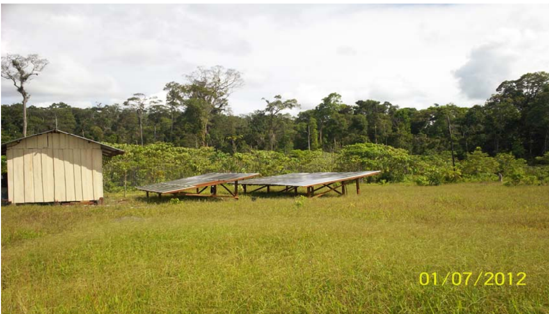
Papua, Indonesia 12Kwp System