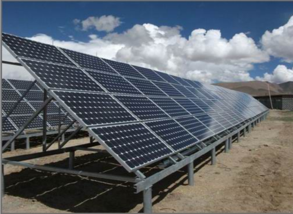
Tibet Nagqu Solar Energy Power Station 300kW, already 50 similar installed there since 2006.