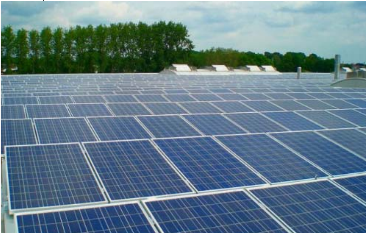
5M, Bucharest Romania, Year 2010