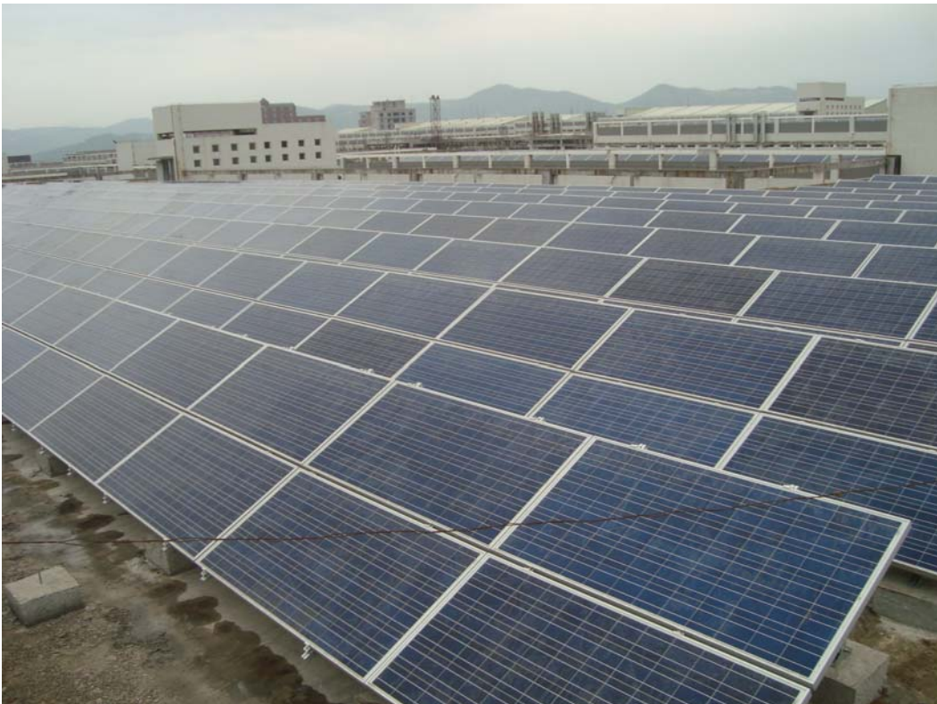
PV Grid-tied PLANT, 8.7M Wp, Year 2010