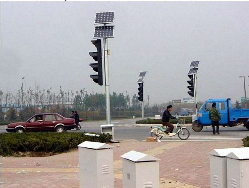
FOSHAN SOLAR TRAFFIC PROJECT 850 SETS