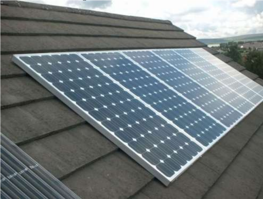
SSGC Pakistan SHS project, 3000 sets installed. (2M Wp) since 2008