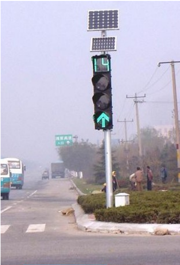
DEZHOU, SHANGDONG SOLAR TRAFFIC PROJECT 600 SETS