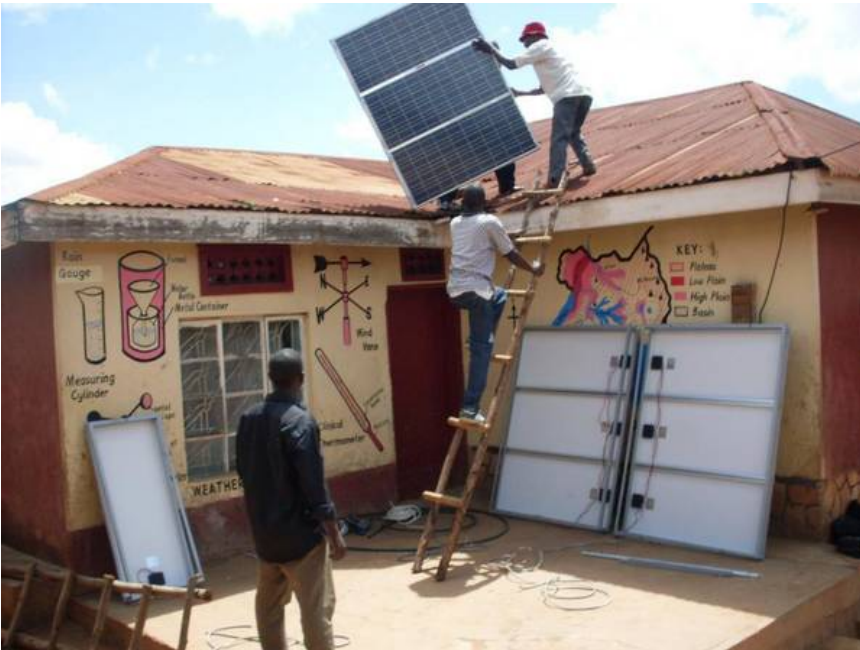
UNICEF Africa solar home system project, over 5 Mega Wp since 2006