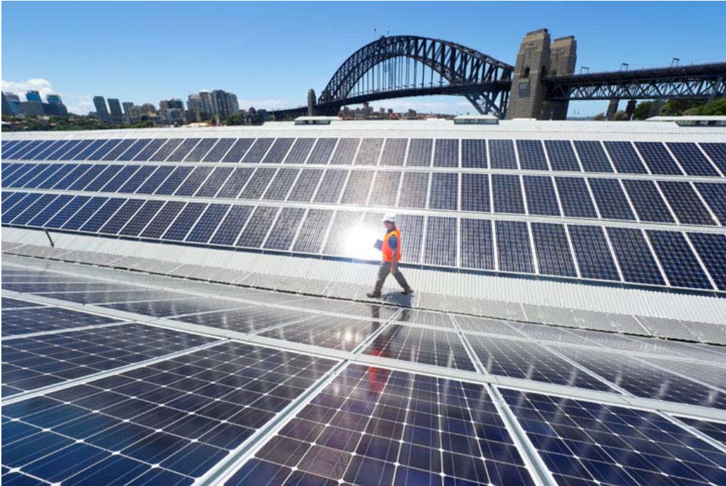
10M, Sydney, Year 2010