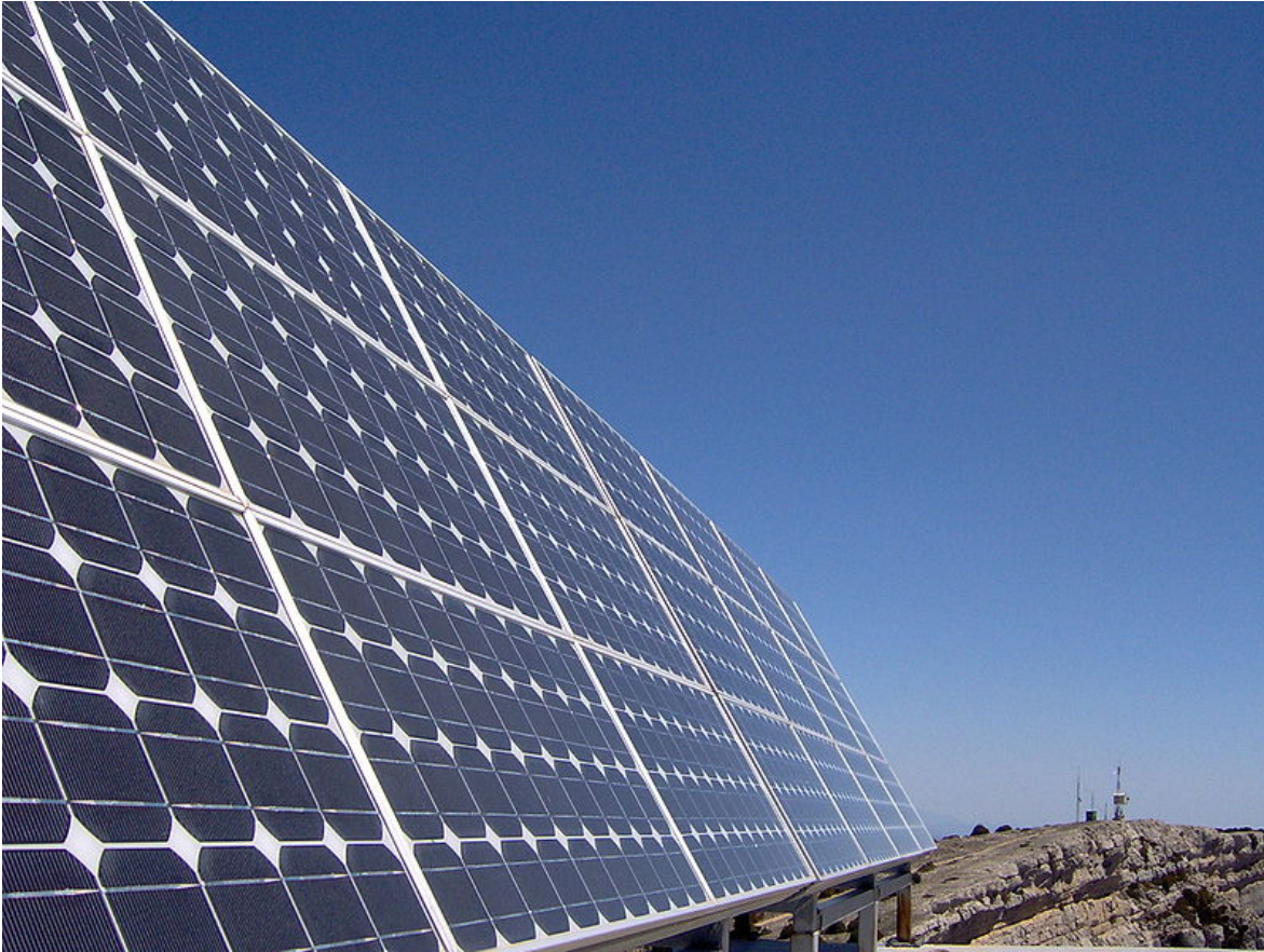
15M GRID-TIED PV PLANT, de Zaragoza, Spain